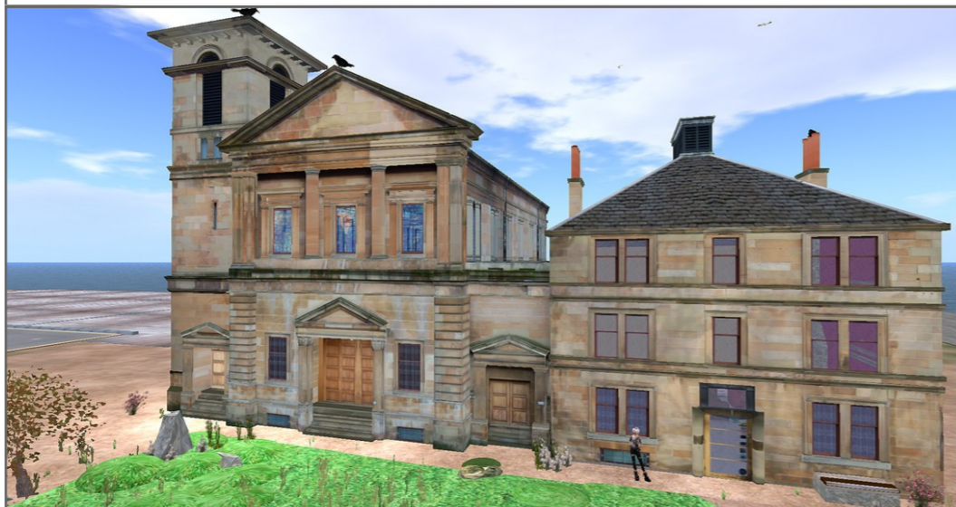
The Piping Centre Glasgow, GCU Island in Second Life