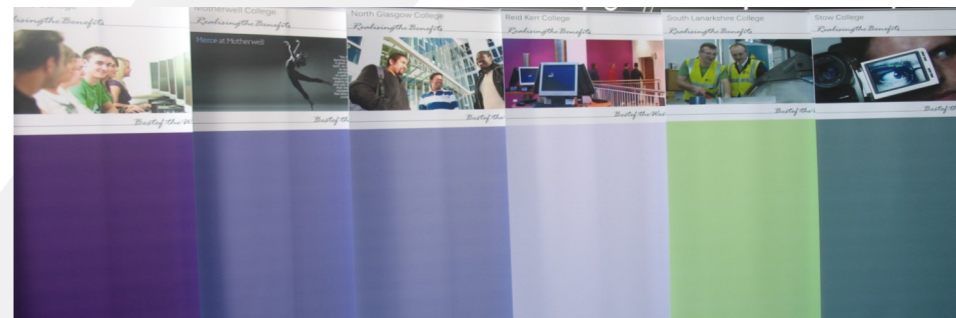
Best of the West banners created for the "Realising the Benefits" event, June 2009

The RSC team will be continuing to provide a comprehensive range of support for all staff, which includes online initiatives and resources such as JISCAsk!; RSCtv; Podcasts; training, as well as strategic advice and support in all technology related areas.